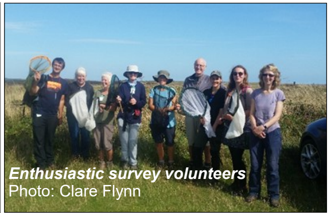
Enthusiastic survey volunteers

The first step to successfully conserving bumblebee populations is to know where they are hanging on, and how many remain. But for many species in Wales, we have very little up-to-date data on this – we need more sightings as a matter of urgency.