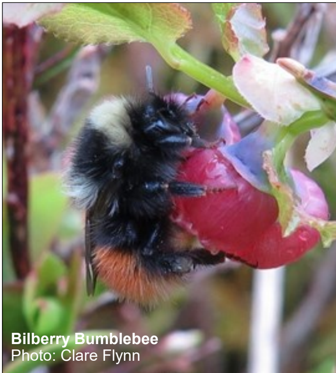
Bilberry Bumblebee

Pembrokeshire is home to some very special bumblebees. We have 23 out of the 24 UK species, including some of the rarest. In the Preseli hills, we have one of Britain's most beautiful bees – the bilberry bumblebee ( Bombus monticola ). On the flower-rich grasslands of the south coast, we have one of the last remaining populations of the UK's most threatened bumblebee, the shrill carder bee ( Bombus sylvarum ).