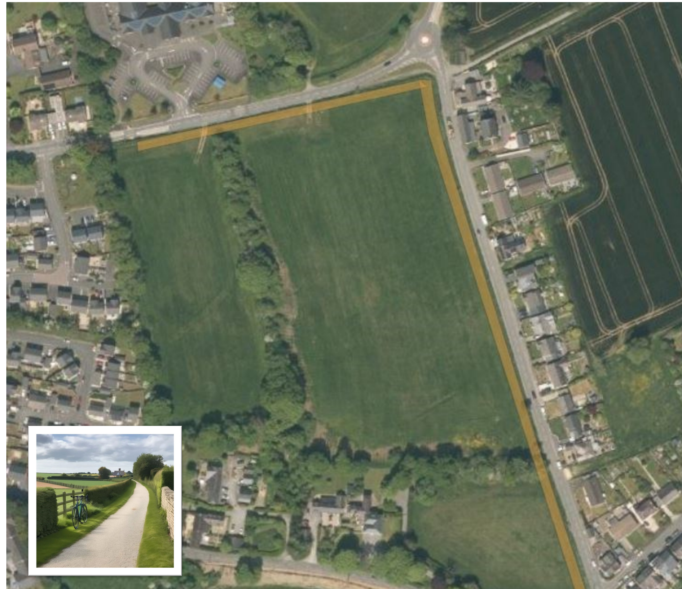
Kiln Road Potential SUP Route